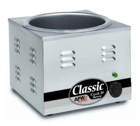
Model CW-1B Classic Cook & Serve