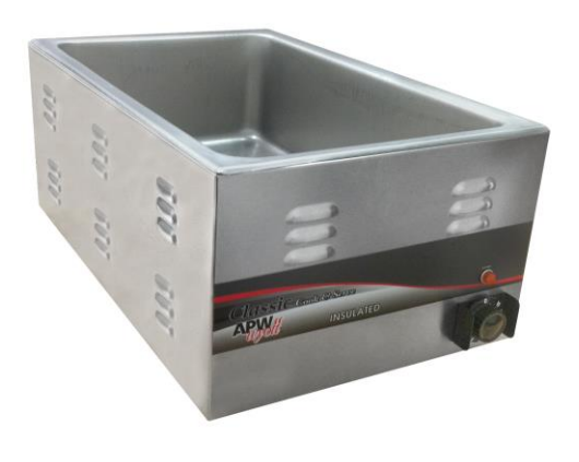
Model CW-2Ai Classic Cook & Serve