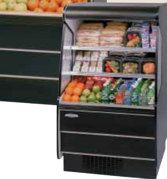
Full-Pan Wall Display, Non-Refrigerated Self-Serve Bakery Case – WDC4276SS: Fresh solutions to your bakery merchandising needs