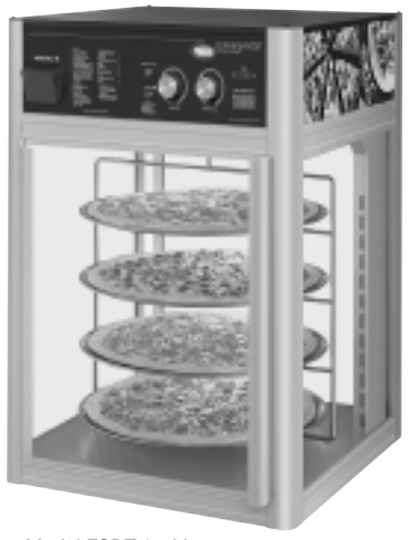
Model FSDT-1 with 4-tier circle rack and accessory decals and food pans