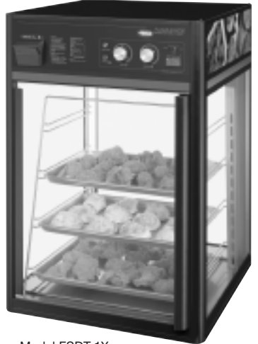
Model FSDT-1X with 4-tier pan rack and optional Designer colors and accessory decals and food pans

FSD-2 (Standard – with revolving rack) FSD-2X (Standard – without revolving rack) FSDT-2 (Tall – with revolving rack) FSDT-2X (Tall – without revolving rack)