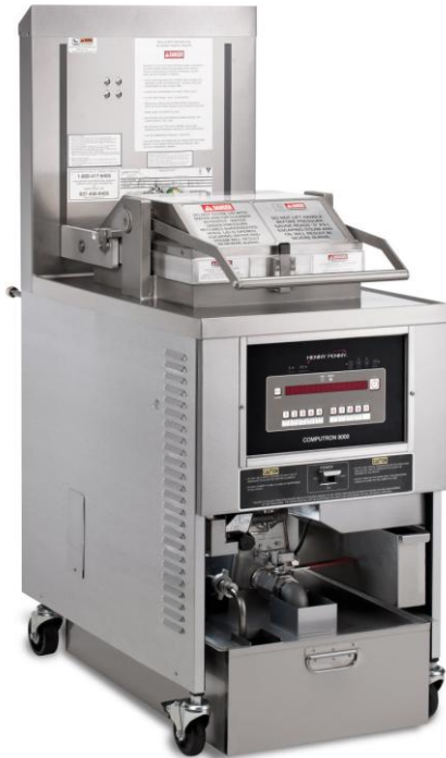
PFG 691 high volume gas pressure fryer

Henny Penny first introduced commercial pressure frying to the foodservice industry more than 50 years ago. Frying under pressure enables lower cooking temperatures for longer oil life, and faster cooking times to meet peak demand. Pressure also seals in food's natural juices and reduces the amount of oil absorbed into product.