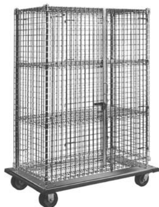
full size dolly truck model with optional center shelves

Item No.: _____ Project No.: _____ S.I.S. No.: _____