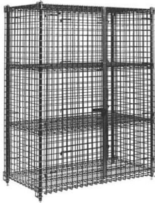
full-size stationary security unit with optional center shelves

Eagle Stationary Mini Security Unit, model _____. Chrome finish with open wire construction and patented Quad-Truss® design shelves. Full-access double door with quick action locking feature with hasps for padlock. 40" overall height.