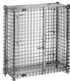
mini security unit

EAGLE GROUP 100 Industrial Boulevard, Clayton, DE 19938-8903 USA Phone: 302-653-3000 • Fax: 302-653-2065 www.eaglegrp.com