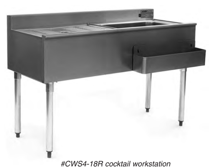
#CVV34-10H COCKIAII WOLKSIAIIOI

Eagle 1800 Series Cocktail Workstation with Sealed-In Cold Plate, model ______. Top, front, backsplash, and ice bin to be heavy gauge type 304 stainless steel. Ice bin to be deep-drawn seamless design, 8" deep, fully insulated, with sealed-in 7-circuit cold plate and 1½" drain. 1½" 0.D. galvanized tubular legs with welded crossbracing and adjustable bullet feet.