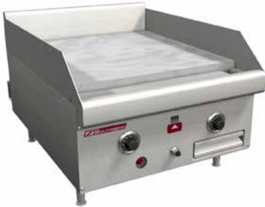
Model shown Model HDG-24