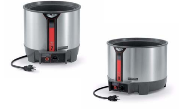
7-Quart and 11-Quart Heat 'N Serve Food Merchandisers