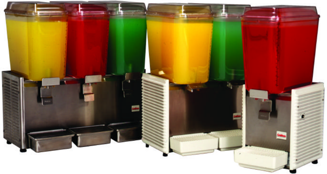
Model D35-3 (with cup activated handles)